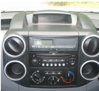
IMAGE LEFT SHOWS ACCEPTABLE LOCATION FOR INSTALLING TACHOGRAPH. T-LIGHT MUST BE FITTED AS PER DVSA REQUIREMENTS ON PAGE 3 OF THIS SHEET IF THE TACHOGRAPH IS INSTALLED IN A DVSA AMBER LOCATION.

POWER AND IGNITION FEEDS CAN BE TAKEN FROM SWITCHED FUSE IN THE FUSEBOX BEHIND THE GLOVEBOX. CONNECT A1 +VE THROUGH 1 AMP FUSE. M1/N1 TO BE SECURED INSIDE NEARSIDE DASH PANEL COVER PICTURED LEFT. CAN SIGNAL IS FOUND UNDER DRIVERS SIDE LOWER PANEL OBD CONNECTOR. CAN INTERFACE TO BE SECURED BEHIND LOWER PANEL AT OFFSIDE.